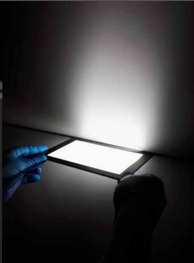
Standalone operation of 8" directional light guide