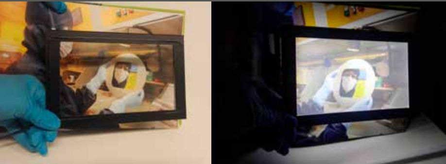
Angular luminance distribution