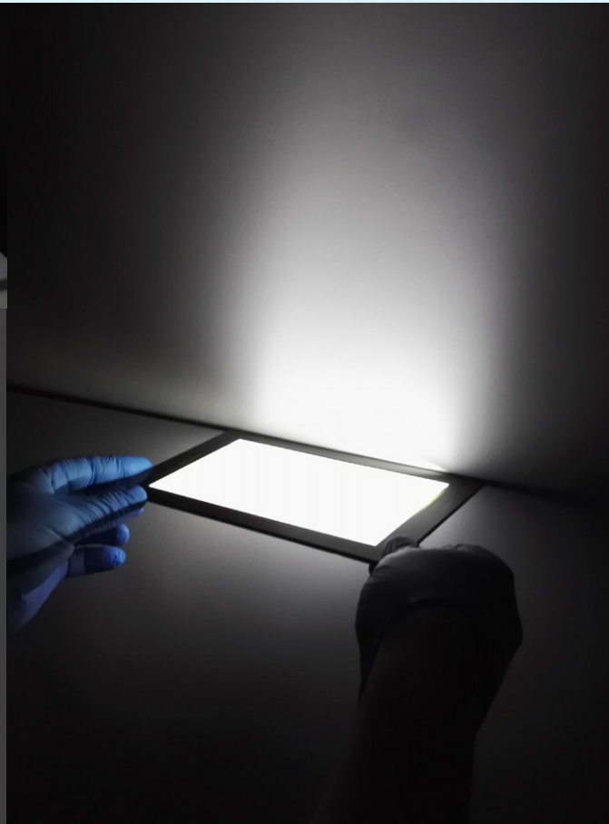
Standalone operation of 8" directional light guide