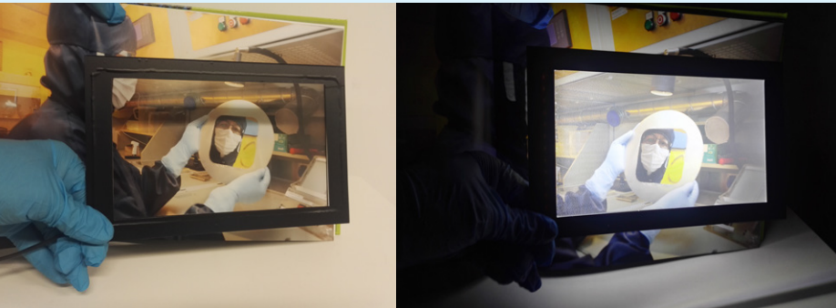
Angular luminance distribution