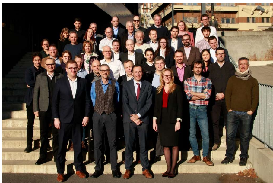
Kick off meeting PHABULOU S EU Project in Neuchatel 15-16/01/2020

PHABULOU S has received funding in the order of 15 Mio. EUR in the framework of the Horizon 2020 Work Programme.